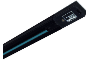
Basic Track RCS170