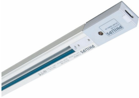
Basic Track RCS170